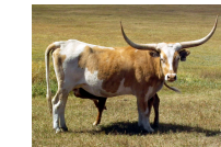
AX L'S OPTIMIM CHOICE