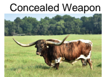
HORSESHOE J CHASTITY